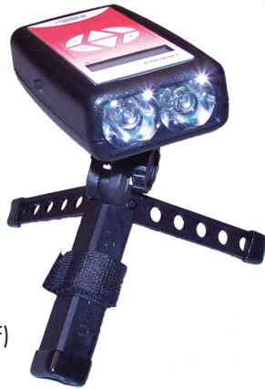
P/N STB100-F with optional Tripod (P/N TP1-F)